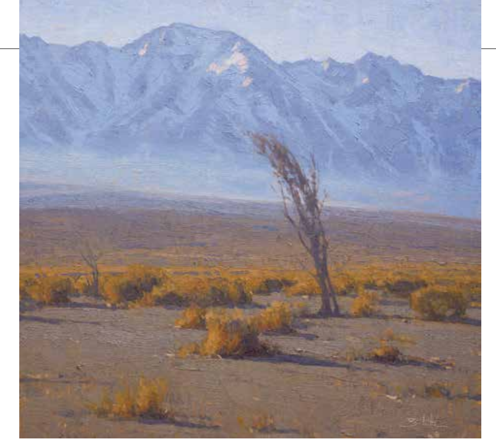
Voices on the Wind, oil, 18 x 18.