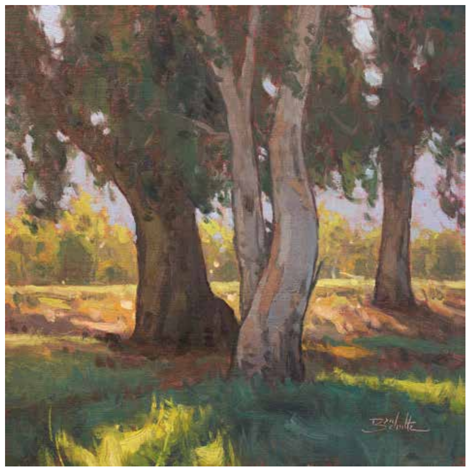
Quiet Shade, oil, 12 x 12.

His move to California inspired the artist to change the way he handled color in his work. "California is blessed with this really atmospheric airiness," he says, and for him, capturing that on canvas meant working in a brighter, high-key palette. This allowed him to more effectively translate the intricate dialogue between color and light, and to communicate the vibrancy of the environment.